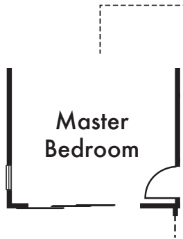
OPTIONAL 9' SLIDING GLASS DOOR AT MASTER BEDROOM